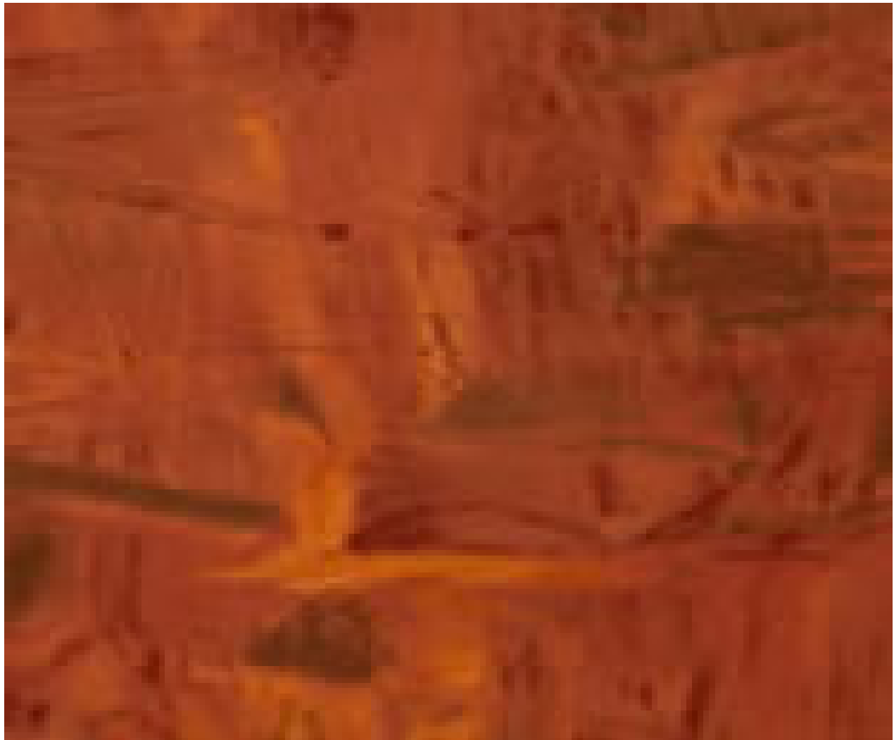
605/Burgundy - Esse-Polichrome

One or two decorative sides made with cellulose paper impregnated with thermosetting melamine resins, which give the surface resistance typical of laminates. The above are pressed for over an hour at a 100 kg/cm 2 pressure and at a temperature on the paper above 130°C. The surface finish is embossed in the laminate through patterned steel press-plates.