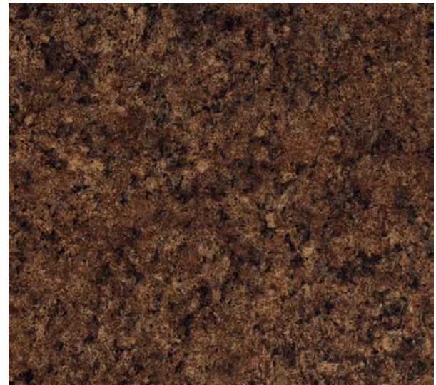
Milano Mahogany 4728

A brown-black and grey granite with sienna quartz.