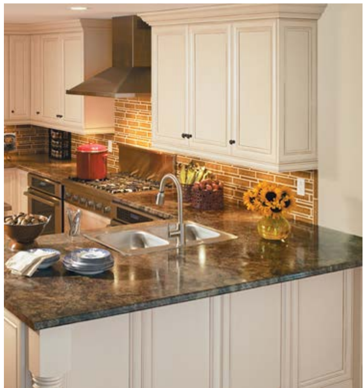
3470 - Red Montana –Finish: Radiance